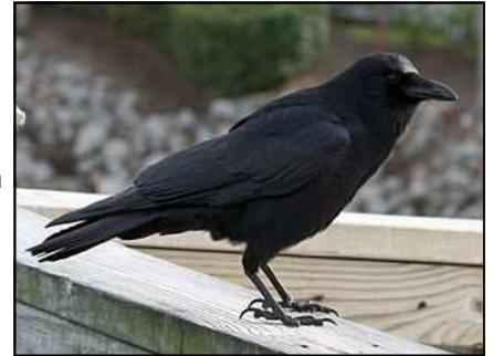
American Crow

American Crows form winter roosts (Oct-Mar) where they sleep together for protection (great horned owls are one of their biggest predators), share information about food and enjoy social benefits. Sounds a lot like humans!