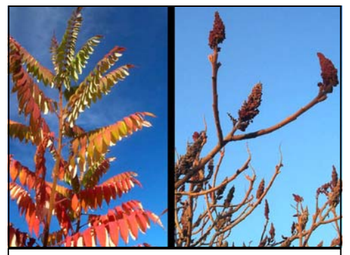
Staghorn Sumac, leaves (l) and candles (r).

Staghorn Sumac is easily transplanted and adapted to many soil types. It thrives in places where the soil is too thin or too dry for larger forest trees. It often occu-