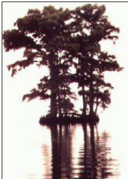
Majestic Bald Cypress at Dragon Run.