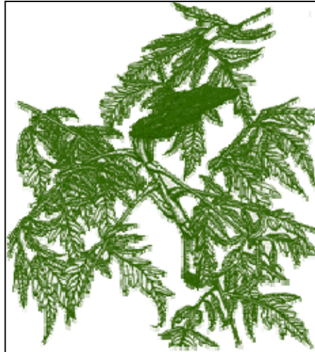
Lacy leaved Rhus typhina 'Laciniata.'

One method of controlling the size and spread is to cut all or some of the stems to ground level in early spring before