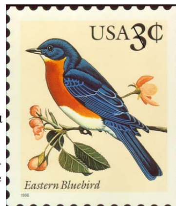
USPS 1996 "America's Stamp."

Everybody loves the bluebird, right?... the symbol of happiness. Yet both males and females can be vicious when competing for a mate. A neighbor of mine told me of an experience she had last spring. It was about 6 am when she looked out of her kitchen window and saw two male bluebirds chasing one another around the edge of her woods. A Barred Owl sat quietly on a branch and watched. In a few moments the two songbirds flew into