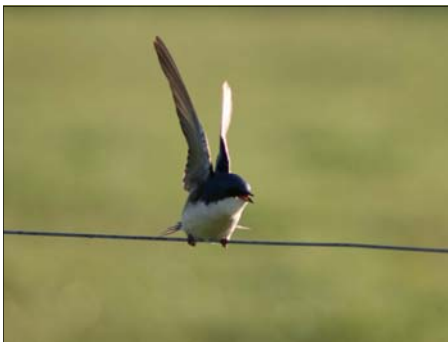
Tree Swallow

In a sense, a bird list of any given area is two lists—those you have seen, and those you haven't seen. While I find of much interest my list of "seen" birds of Mexico, a country I have visited many times, of much greater interest to me is my list of "unseen" ones. With every trip, that list diminishes a little. On that list are a hodgepodge of birds in scattered locations of the country that are hard to find, and thus missed when I was there, others I missed while off taking a rest stop in the bushes, ocean birds, and various other nocturnal, shy or just plain scarce birds. Therefore, when I plan a trip to Mexico nowadays, I look for a spot which offers me the greatest chance at several of these "unseen" birds.