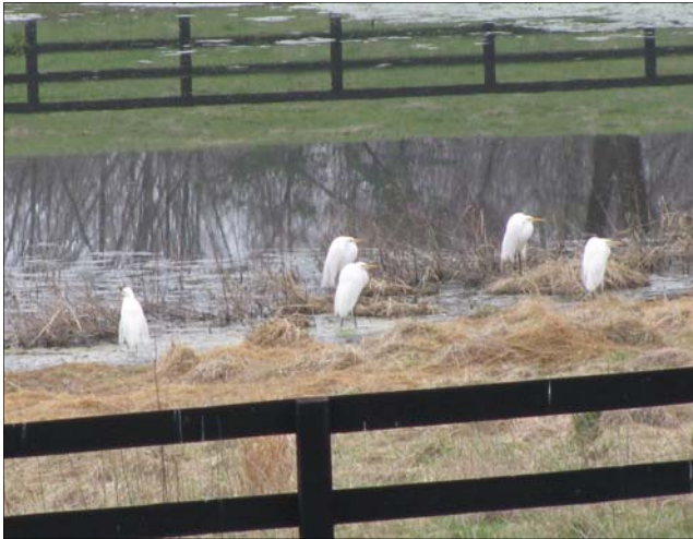
Great Egrets at King Family Vineyard.

Our May 14th meeting is the traditional Members' Night. Anyone who would like to share pictures of birds or birding experiences is welcome to do so. There will be a slide projector and a digital projector and laptop for PowerPoint presentations.