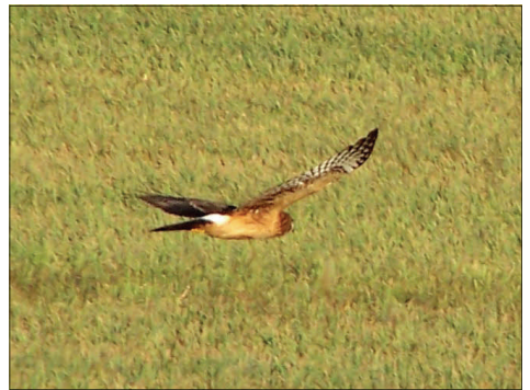
Northern Harrier at Langborne Road Farm .

January 10: Peggy Opengari will present "Borneo and Peninsula Malaysia "Land Below the Wind"