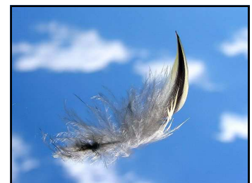
Feather in Flight

As is our custom, we take our speaker to dinner before the program. I encourage you to come to the Brick Oven Restaurant at Rio Hill Shopping Center at 5:30 for food and socializing. We have gone there enough times that our waitress has gotten to know us as the bird people. She, along with the speaker, is worth meeting.