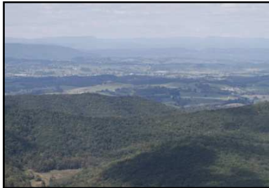
View from Hanging Rock Observatory

Raptors have made this trip for thousands of years, and I couldn't help thinking about how much the land has changed beneath them. A few years ago, I read the book 1491 by Charles Mann. According to Mann, prior to the arrival of Europeans, virtually all of the forests along the East Coast would have appeared like a modern park today. The Native Americans managed the land with fire; large areas of land were devoted to agriculture; towns of significant size dotted that landscape from (what is now) Maine to Florida. Although I doubt they counted the raptors, I am sure these people were well aware of the migration spectacle each year.