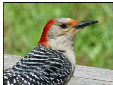
Red-bellied Woodpecker, female (above) Red-headed Woodpecker (below)