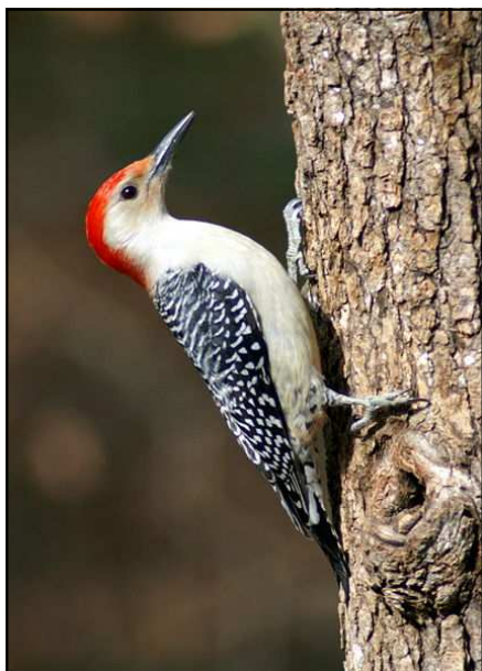
Red-bellied Woodpecker, male

The Red-bellied Woodpecker, our most common woodpecker, is often mistaken for the Red-headed Woodpecker because both species have bright red on their heads. The Red-bellied male has a red forehead, crown and nape (back of neck); the female has red only on the nape. The Red-headed, however, has a completely red head, including the cheeks and throat. It is the least common woodpecker in our area.