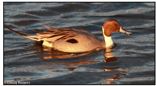
A single Northern Pintail (no plethora here)

If y first two weeks of October were spent at an ocean front home on North Carolina's Outer Banks, a locale that has excited my birding energies for a number of decades. This occasion, however, was elicited by celebration of 50 years of our marriage of which at least 17 years have been the best years of my wife's life, according to her. This also meant that these two weeks were designed to be spent in the company of close friends and relatives who were slated to rotate through the doors of our rental over the fortnight. This and the effects of Hurricane Joaquin had a definite impact on my birding activity although all visitors certainly understood this long-standing affliction of mine.