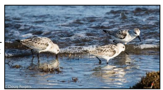
A trio of Sanderlings

"Our" house, although ocean front, was protected somewhat by a grass and sea oat covered dune that sat between the house and the ocean. Upon the high point of this "barrier dune" sat a 16' x 16' deck with benches which commanded a closer look of the ocean and the beach and where many a cup of morning coffee was consumed while awaiting the sunrise (again, post -Joaquin) and marveling at the Brown Pelicans and assorted gulls as they mastered the ever-present winds and stiff breezes that were virtually a constant condition. Aside from Sanderlings and Willets, an occasional Osprey and the squatting Ring-billed, Laughing and Lesser Black-backed Gulls, the beach was devoid of species such as turnstones and plovers. Late one afternoon,