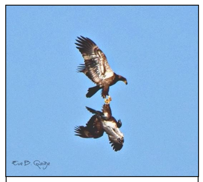
Eve Gaige sent in this incredible photo of an aerial encounter between two Juvenile Bald Eagles

Whether it's battle, ballet, or just play, there's no denying it's another of Eve's fabulous shots!