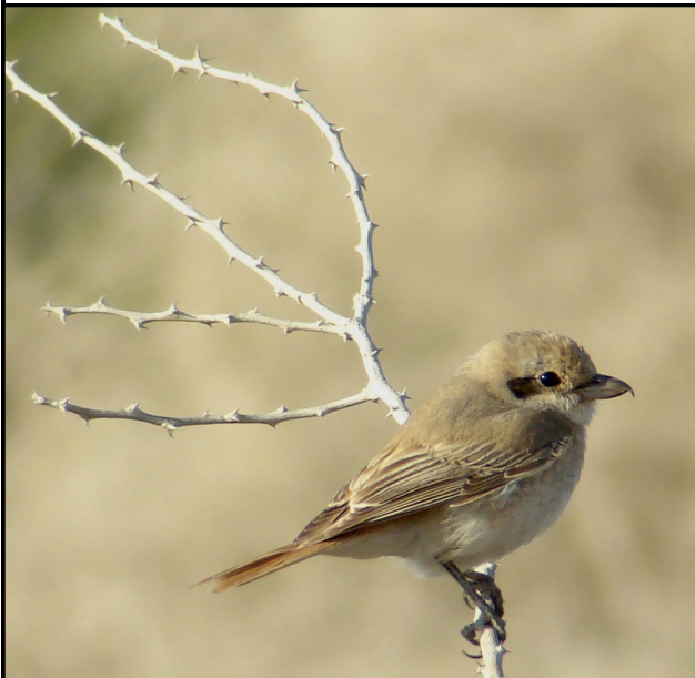
Isabelline Shrike