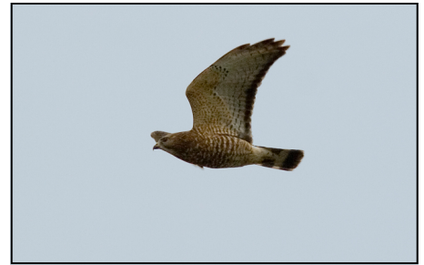
Adult Broad-winged hawk.

There is no way to adequately describe the event. There was a thick haze carpeting the valleys to the east and west with a light S to SSE wind blowing. With the high dome of cloud cover with few breaks, the birds would be dependent on updrafts to get them up and over and down the ridges. The first groups of birds were spotted out over Waynesboro to the west, coming in low and at times becoming lost in the thick haze. Then another loose kettle was spotted a short distance above the first one. In between the kettles, more birds were streaming through, flapping hard, and then funneling into another forming kettle. There were kettles over kettles, with streaming birds in between and more nearby kettles, and birds rising up from the valley floor below. This remained consistent for most of the flight with some streaming along on the east side