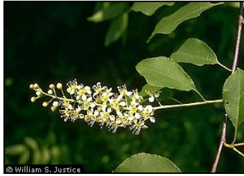
Prunus serotina or Black Cherry.

Black Cherry flowers found in mid to late spring are small but very obvious because they are clustered in columns. Small ½