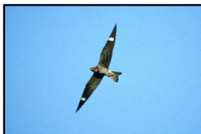
Common Nighthawk