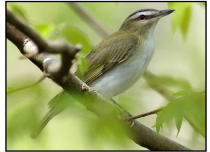
Red-eyed Vireo

Were it not for the voice of this summer visitor, the Red-eyed Vireo would be an inconspicuous bird. It is well camouflaged among the leaves of woodland trees where it resides, with its olive back, pale underparts, white eyebrow and black line through the eye. The red eye is discernable only with a close-up view. Vireos generally move more slowly than warblers, for example, because they are a little bigger and seek larger insects. Their beak is thicker than that of a warbler, with a tiny hook at the tip, which facilitates capturing prey. The voice, however, is what tells us that the Red-eyed Vireo is a constant companion throughout the summer. The bird sings any time during daylight hours. A lyrical, question-answer song, it seems to say, "Where are you? Here I am." The nest hangs in the fork of two twigs, around which they tightly wrap fine fiber to hold the nest in place. Look and listen for the Red-eyed Vireo in the deciduous woods of Ivy Creek. Take your time. You have all summer to find it.