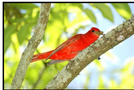
Summer Tanager