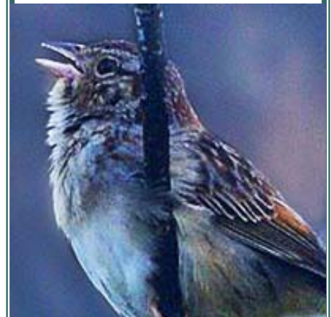
Bachman's Sparrow