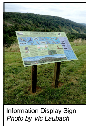
Information Display Sign

We hope to see you up at "the Watch" this fall! http://www.rockfishgaphawkwatch.org