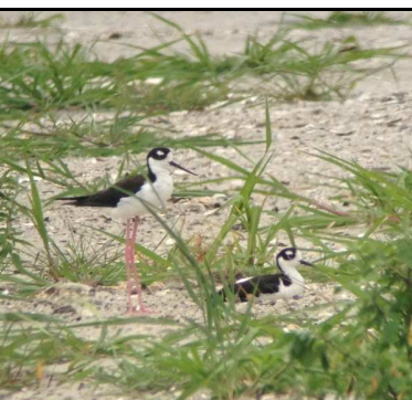
Black-necked Stilts